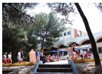
Antibes College Campus

Courses are very popular and are likely to become fully booked during the July/August period.