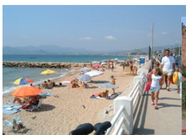
It's a 3-minute walk to the beach !

Fly to Nice and take the shuttle bus to Cannes or the college arranged transfer service from Nice airport, budget for 30/35 Euros for the arrival transfer fee (please discuss with CESA). The return travel is generally made by taxi with others returning to Nice that Saturday and is organised once in Cannes.