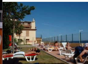
The Cannes college has its own enclosed terrace, with sea view !