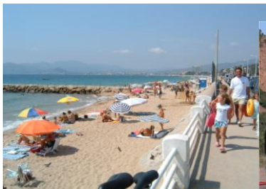
It's a 3-minute walk to the beach !

Fly to Nice and take the shuttle bus to Cannes or the college arranged transfer service from Nice airport, budget for 30/35 Euros for the arrival transfer fee by school mini bus (please discuss with CESA). The return travel is generally made by taxi (cost vary : EUR 85.00/100.00 per taxi) with others returning to Nice that Saturday and is organised once in Cannes.